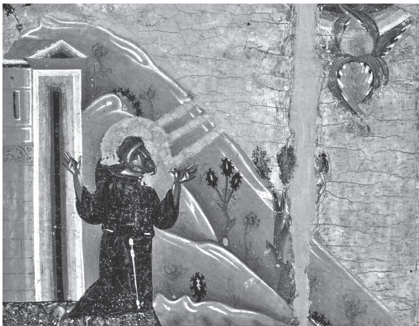
Stigmata (from Bardi Dossal 1245)

The recreation of the first Christmas scene at Greccio, the intense love for the Eucharist, and the mystical events of a lonely retreat on LaVerna and the reception of the stigmata bear eloquent witness to Francis' tremendous devotion to Christ.