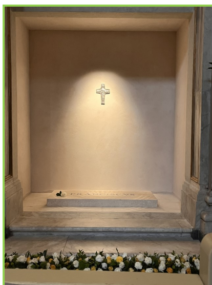
Tomb of Pope Francis