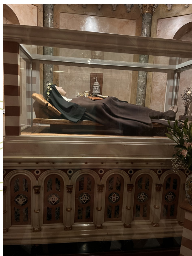
Tombs of Francis and Clare