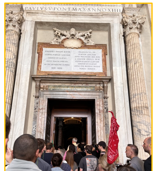
St. Peters Holy Door