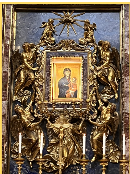
Painting of Mary

On Monday after our arrival in Rome on May 5, we headed to Santa Maria Maggiore to pray at the tomb of Pope Francis, asking his intercession for the election of the new Pope and for our appointment on 8 th May with the Dicastery. We also prayed before the Blessed Sacrament and the painting of Mary, before which Pope Francis prayed on many occasions. We then walked to St Peters to enter through the Holy Door, during this Jubilee year of the Pilgrimage of Hope. Once again, we prayed in the Blessed Sacrament Chapel interceding for all in our Institute and once again asking special blessings on our visit to the Dicastery.