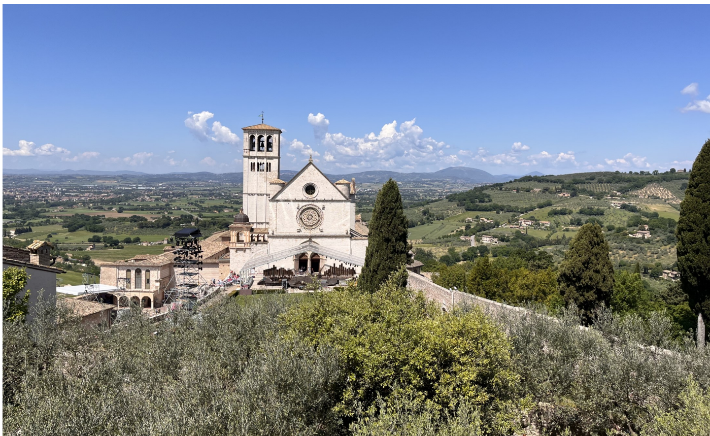
Basilica of St Francis